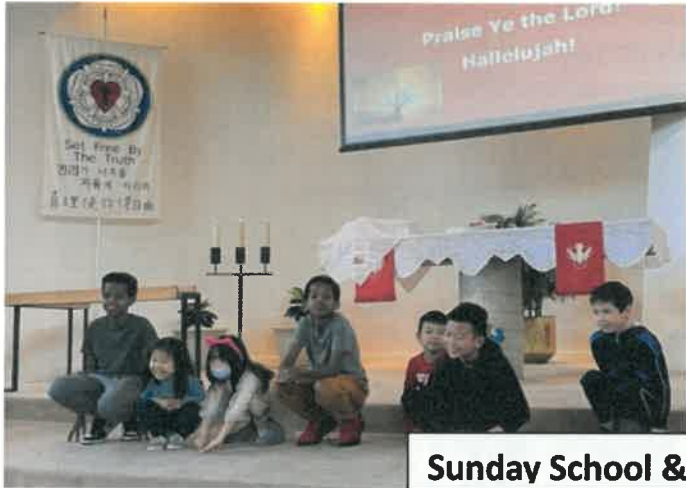
Sunday School & Chinese Choirs