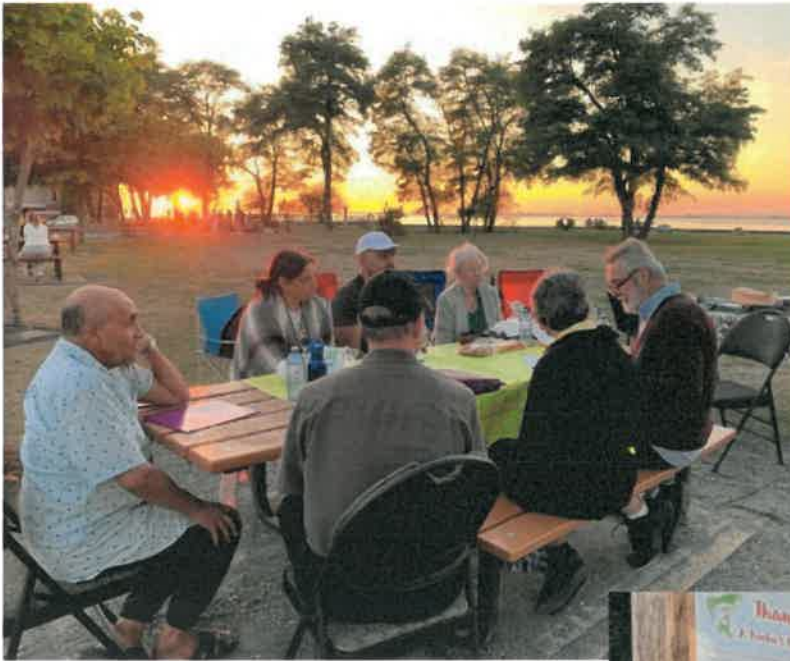
Bible Fellowship & Supper at Blackie Spit on September 21 st