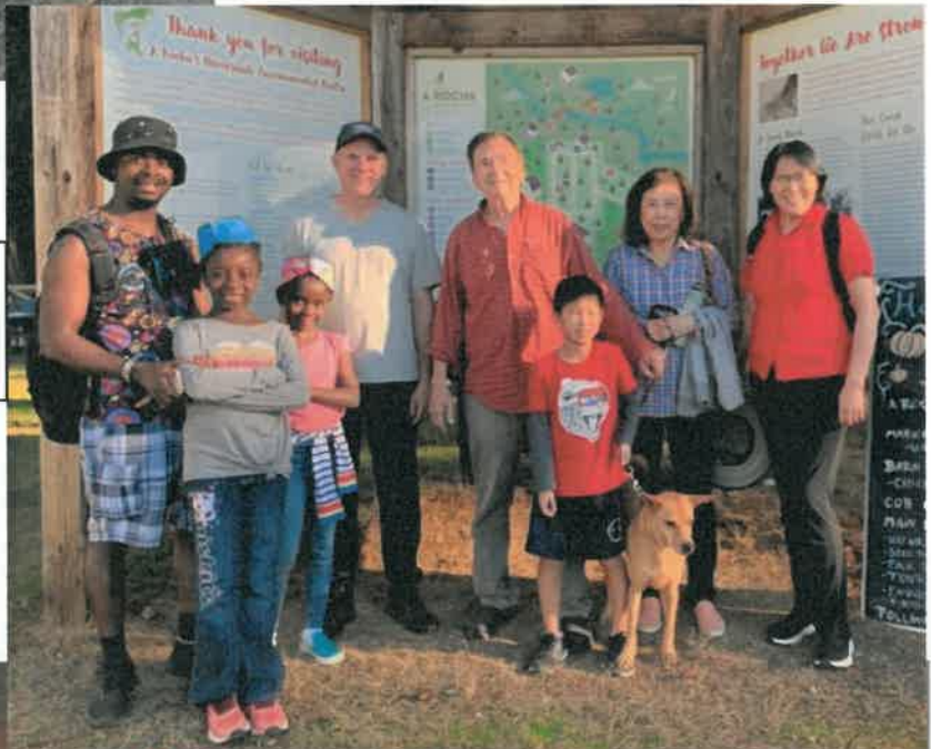
Harvest Celebration at A Rocha on Saturday, October 7 th