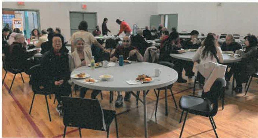
Reformation Potluck Fellowship