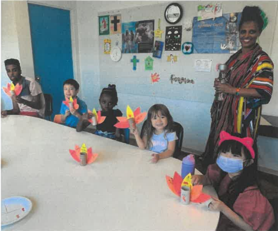
Sunday School Primary Class Show their Thanksgiving Crafts