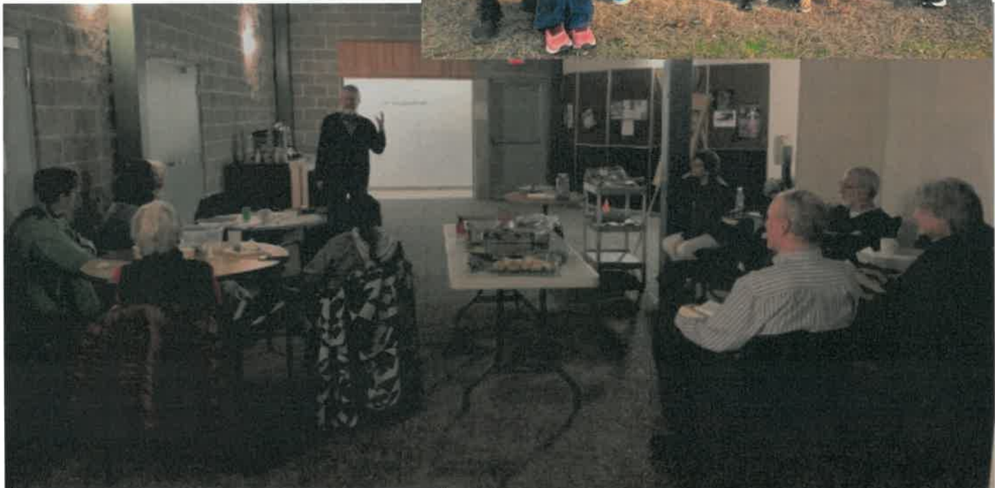
Bible Study & Supper on October 19 th