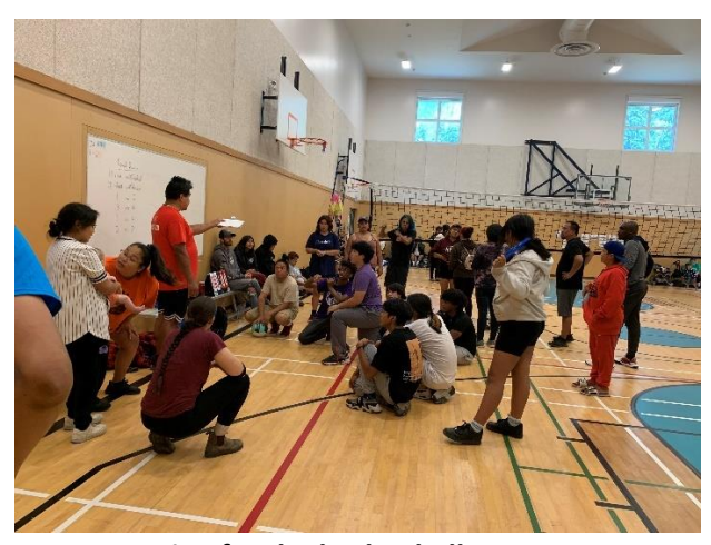
Preparing for the basket ball tournament