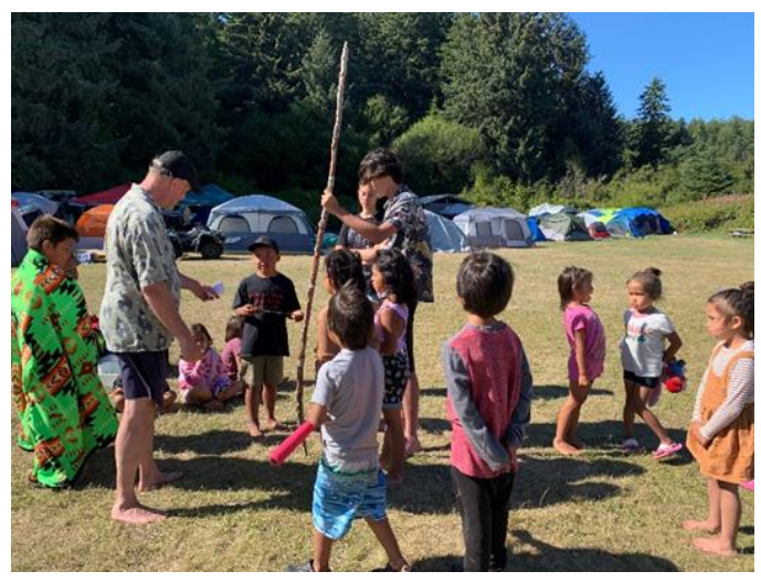
Dramatization of David and Goliath