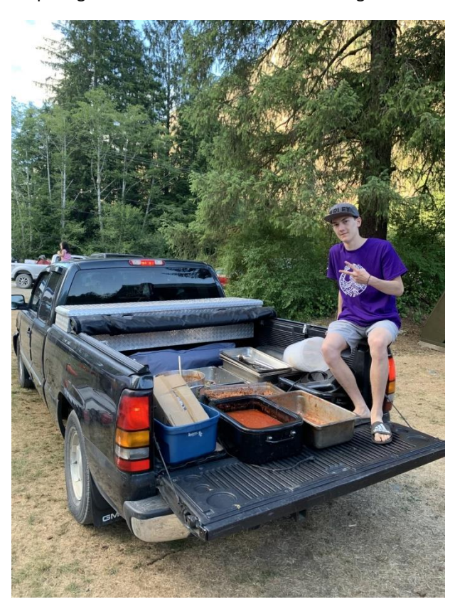
\uparrow Returning Dirty Dishes to the Kitchen / BFF \downarrow