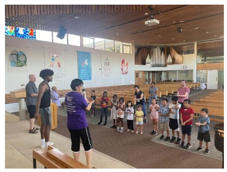
Teaching the children actions to the songs