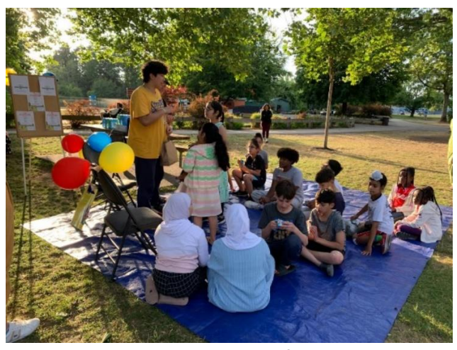
Working on crafts