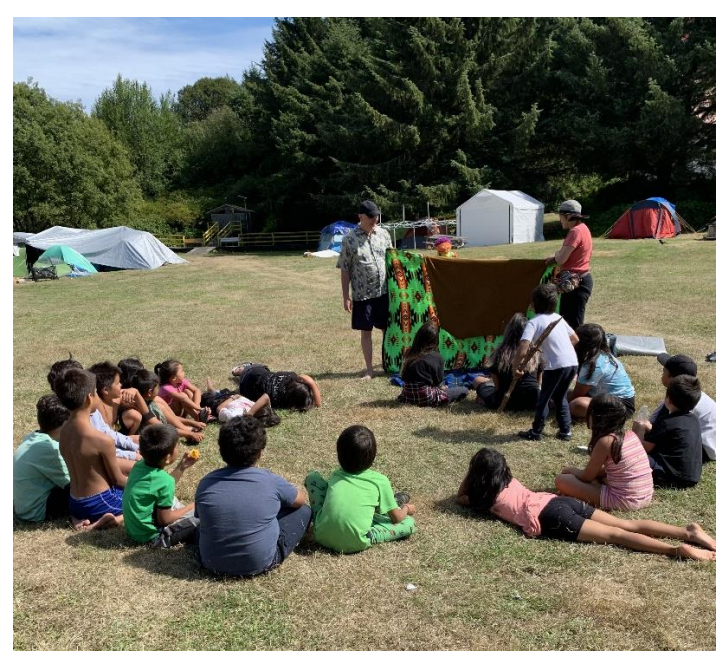
The story of Noah as told by puppets