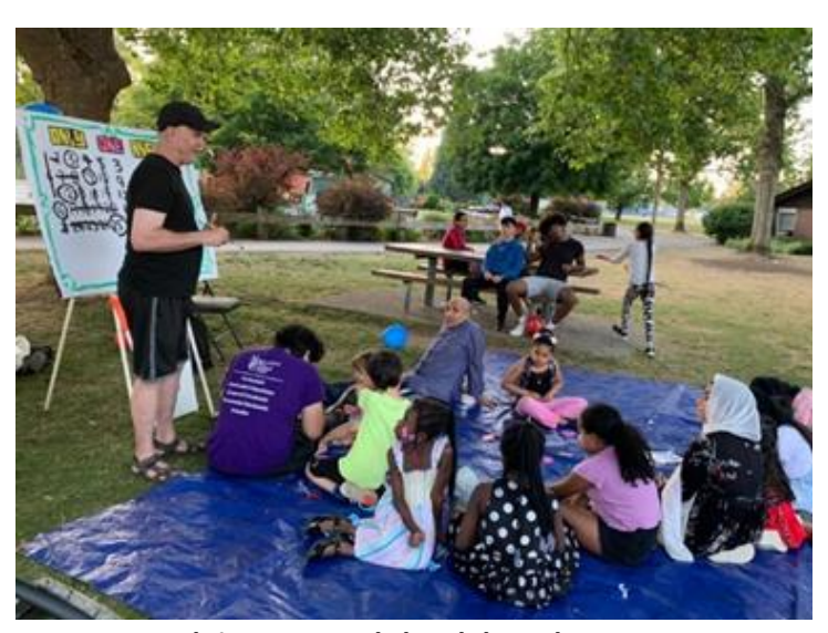
Pastor doing a Gospel sketch board message