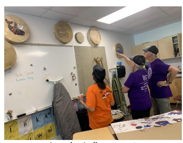
Learning Indigenous art