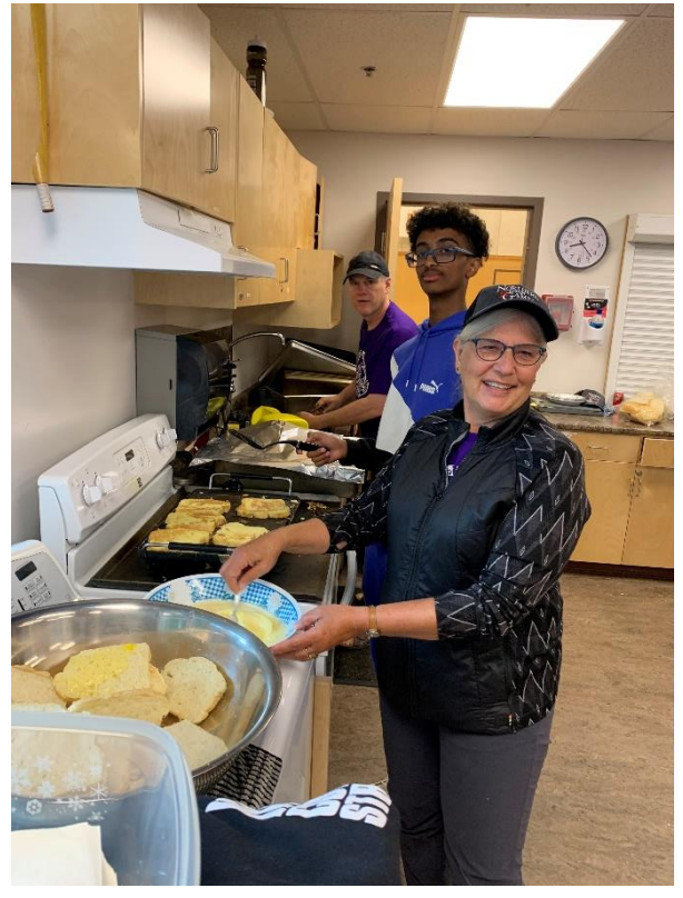
Making French toast for breakfast