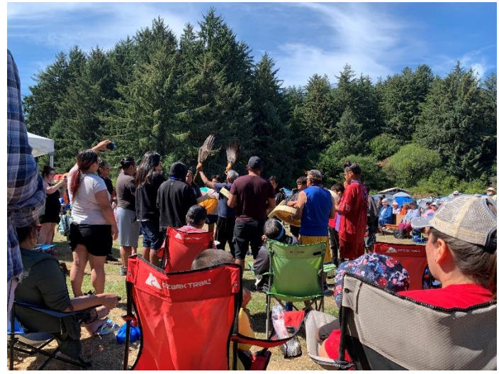
Celebrating the Centennial of Yuquot's designation as a National Historic Site with Dignitaries and singing.