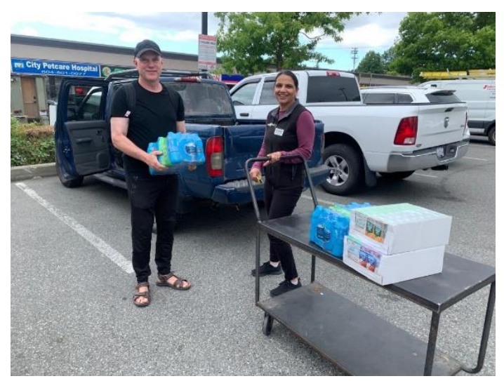
Save-On-Foods sponsored our VBS, donating juice and water.