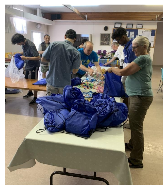
Packing 300 Gift Bags for the NRG